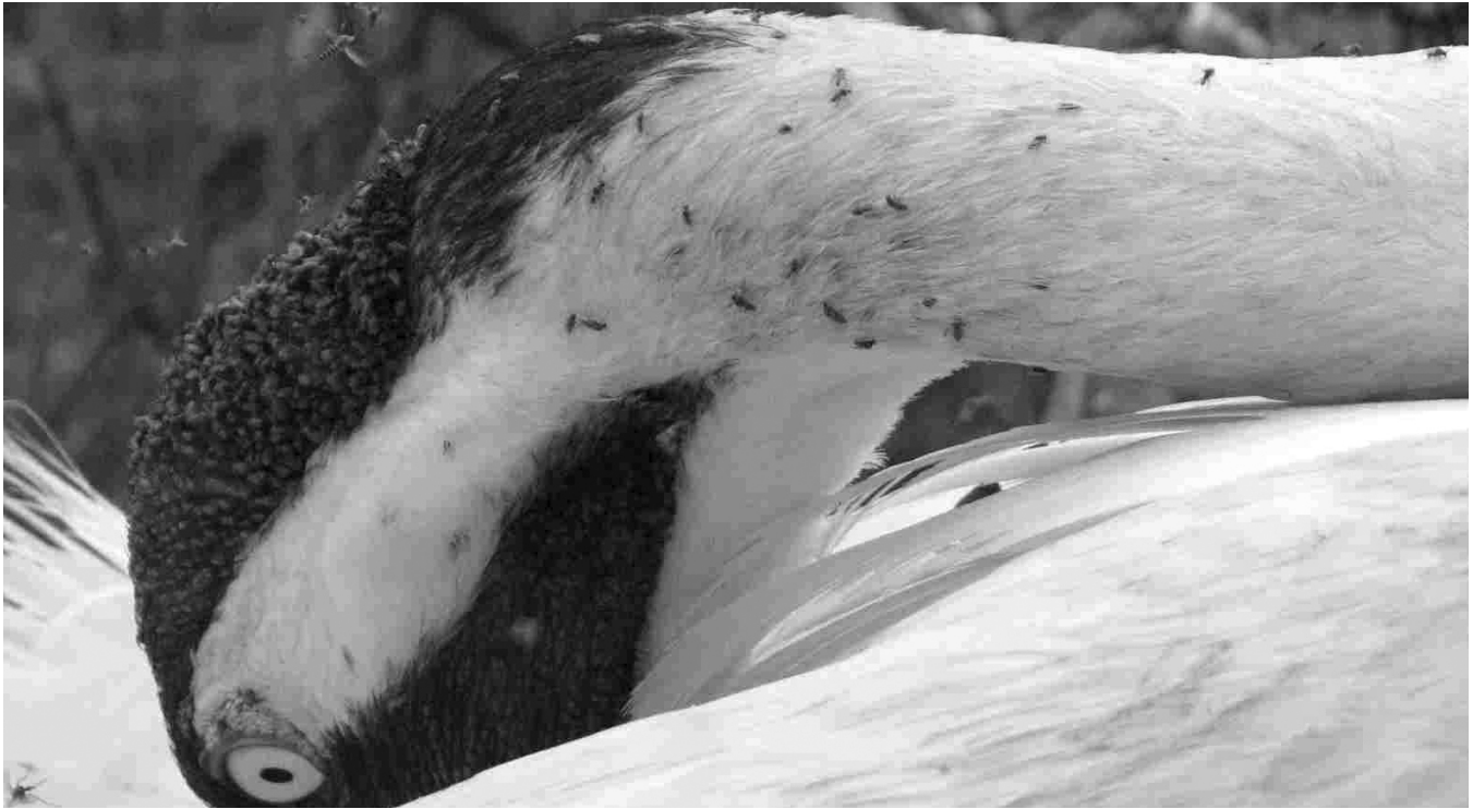
Figure 3. Black flies feeding on whooping crane, Necedah National Wildlife Refuge, Wisconsin, May 2008. Note blood in feathers, bleeding wounds, black flies burrowing under feathers, and black flies embedded in papillae of crown. Photo possible at <1 m because this unpaired adult female was atypically imprinted on the costume and could be closely approached.