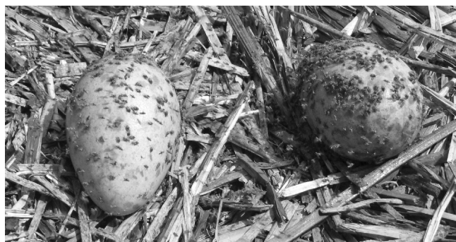
Figure 2. Swarming black flies on eggs in nest of whooping crane pair on day of desertion, Necedah National Wildlife Refuge, Wisconsin, 6 May 2008.