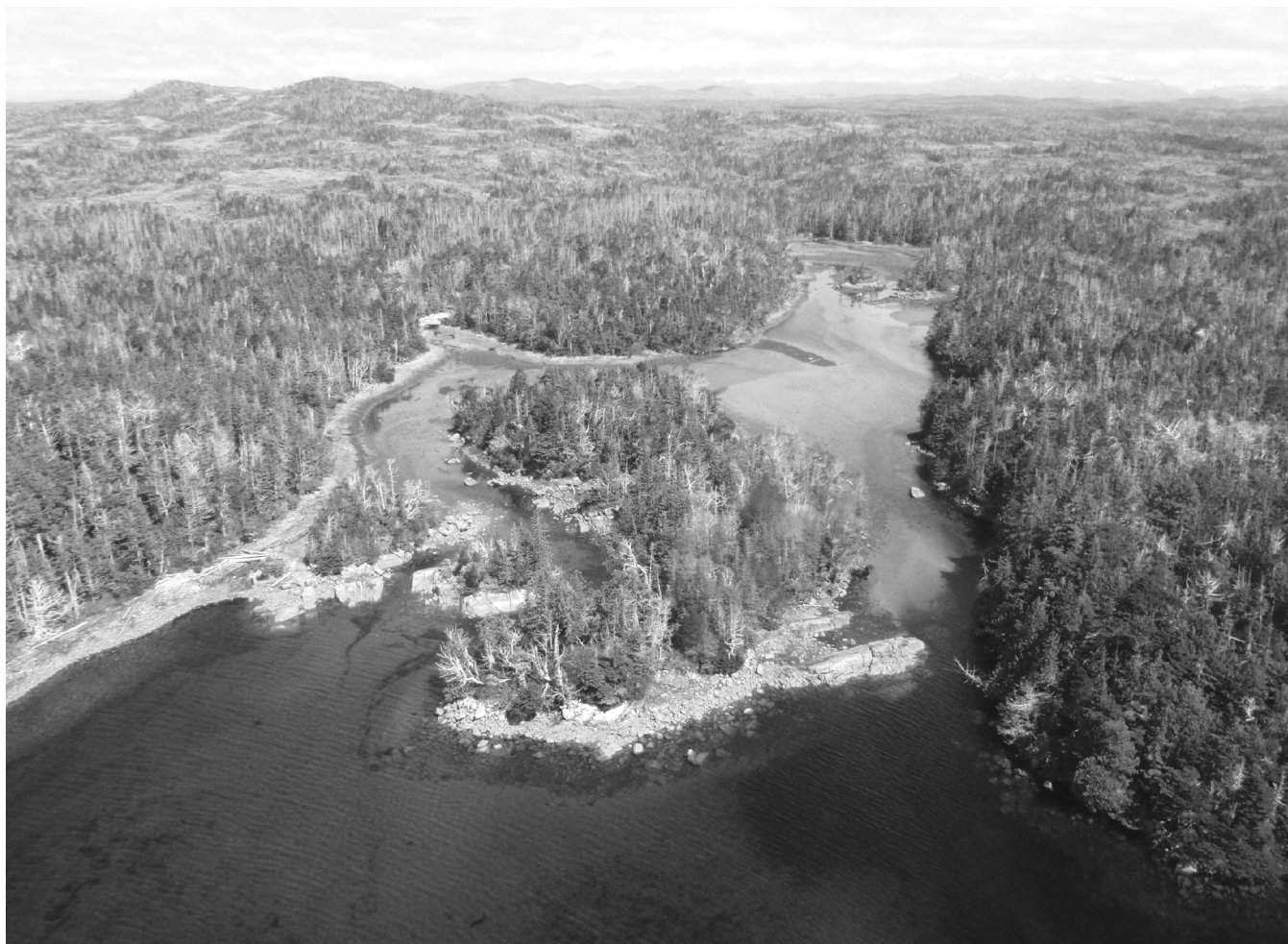
Table 1. Results of helicopter surveys for sandhill cranes on the central and north coast of British Columbia. B = bog, E = estuary, M = marsh, T = total.