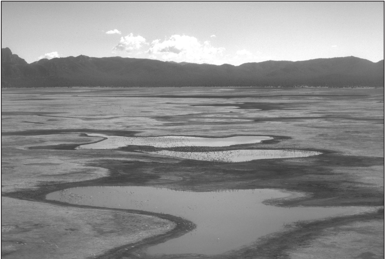
Laguna de Babicora, Chihuahua, Mexico, 7,000 ft elevation, the most important sandhill wintering area in Mexico, wintering up to 50,000 cranes.