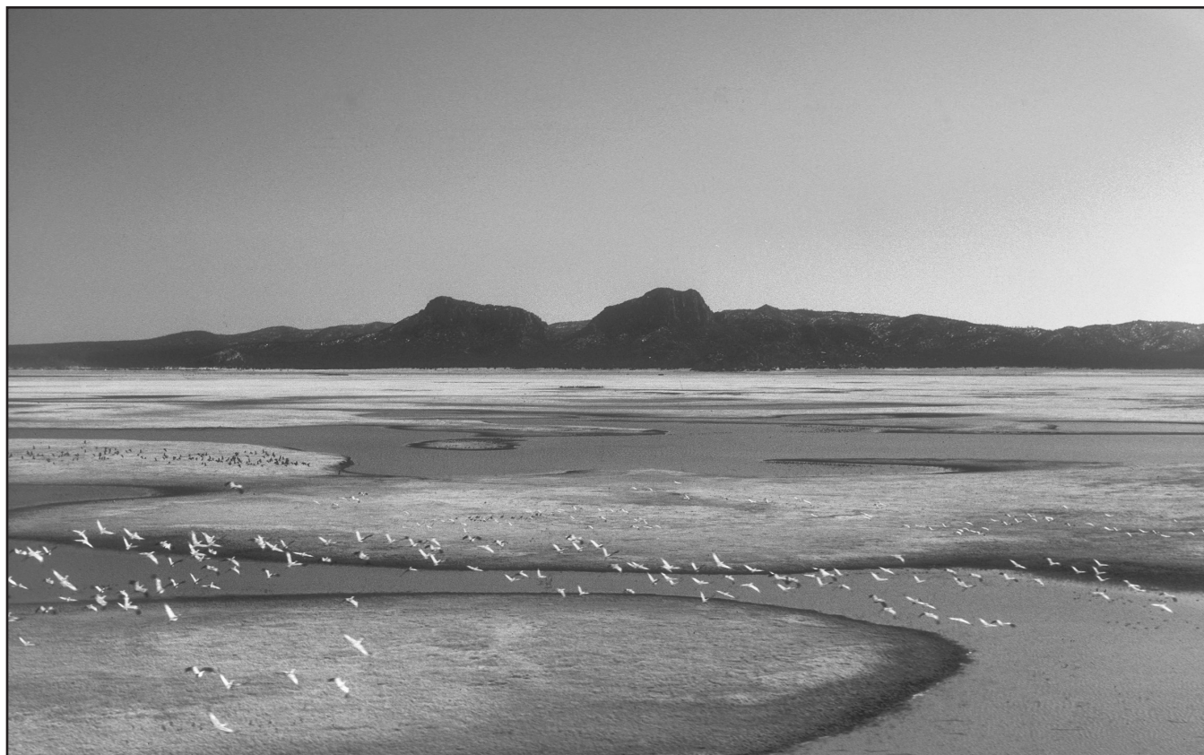
Laguna de Babicora, Chihuahua, Mexico, 7,000 ft elevation, the most important sandhill wintering area in Mexico, wintering up to 50,000 cranes.

Walkinshaw, L. H. 1973. Cranes of the World . Winchester Press, New York, New York, USA.